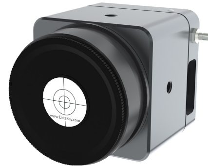
TaperCamD-LCM 2.25 x 2.25 x 1.13"

The TaperCamD-LCM is paired with DataRay's full-featured, highly customizable, user-centric software (which has no license fees, unlimited installations, and free software updates). It is perfect for applications including: CW and pulsed laser profiling; field servicing of laser systems; optical assembly; instrument alignment; beam wander and logging; R&D; OEM integration; and quality control.