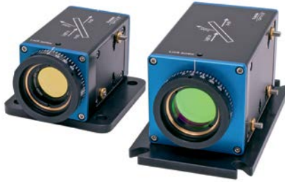
990-0077 and 990-0078 Laser Power Attenuators

This manual variable attenuator series is designed to continuously attenuate linearly polarized laser beams. They feature precision opto-mechanics and high-LIDT optical components incorporated in a compact housing to ensure stable and reliable performance.