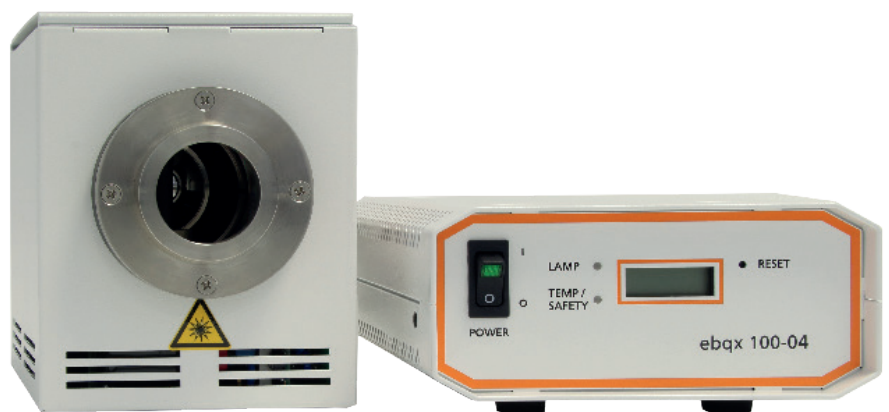
Fig. 3: Deep UV illumination system